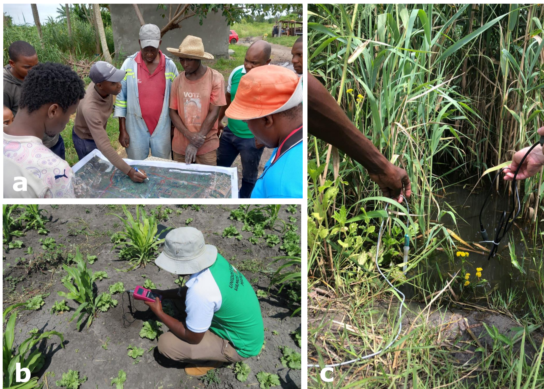
Figure 1: Participatory mapping workshop (a), in-field data collection with portable sensor equipment STEP Systems COMBI 5000: Activity and pH reading in soil (b) EC and pH reading in water (c).