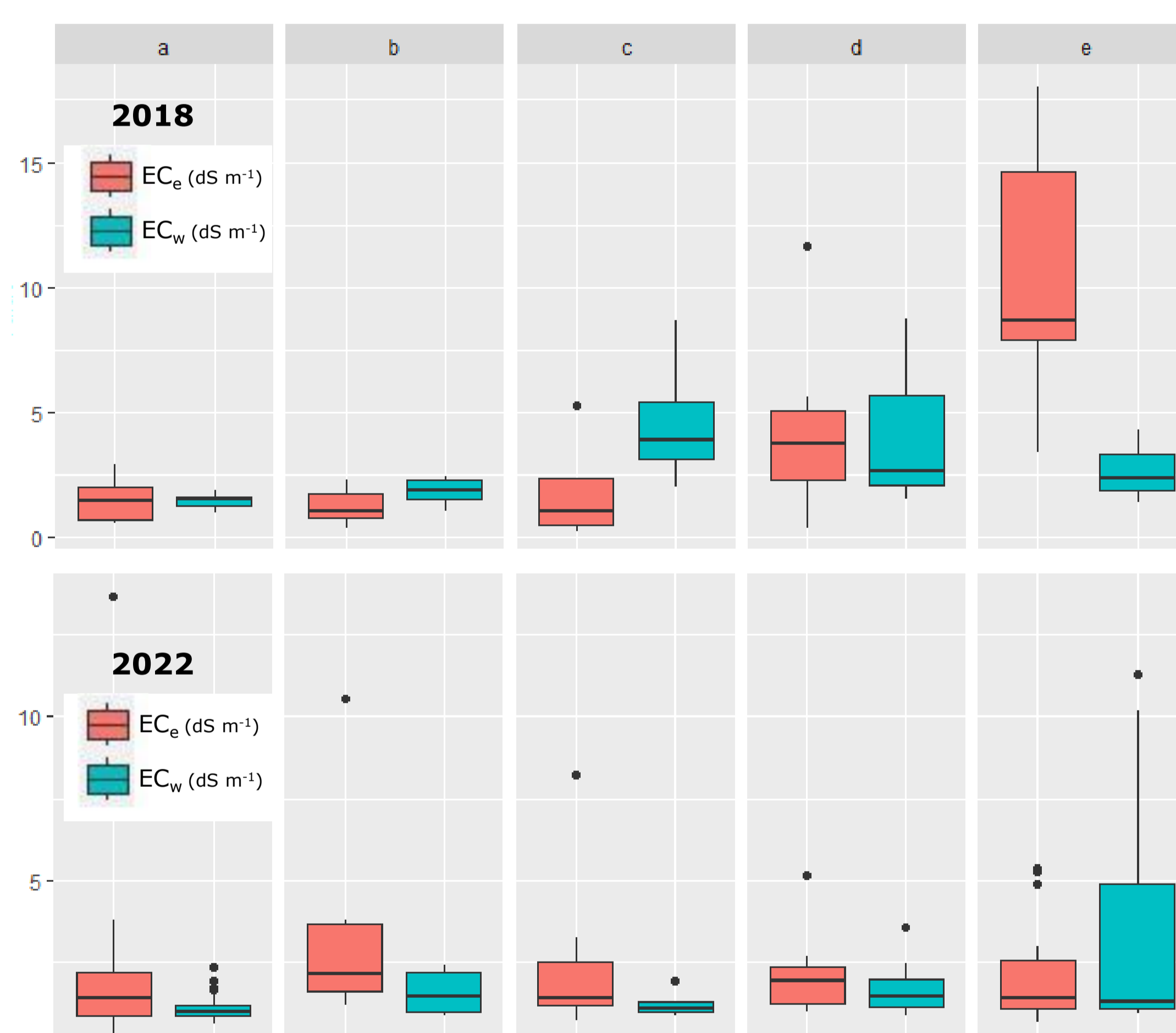
Figure 2: Measured salinity levels of upper 20 cm soil layer ( EC_e ) and irrigation water source ( EC_w ) plotted against local farmers' salinity categorization (a-e), for mapping exercises of 2018 (farmers' associations Thomas Sankara and Costa do Sol, n=40; upper section) and 2022 (farmers' associations Djaulane and Massacre de Mbuzine, n=97; lower section). Farmer salinity categories are defined as: (a) 'non-saline', (b) 'slightly saline' (25-50% yield loss), (c) 'saline' (50-75% yield loss), (d) 'too saline for crop production' (75-100% yield loss), (e) 'highly saline'.