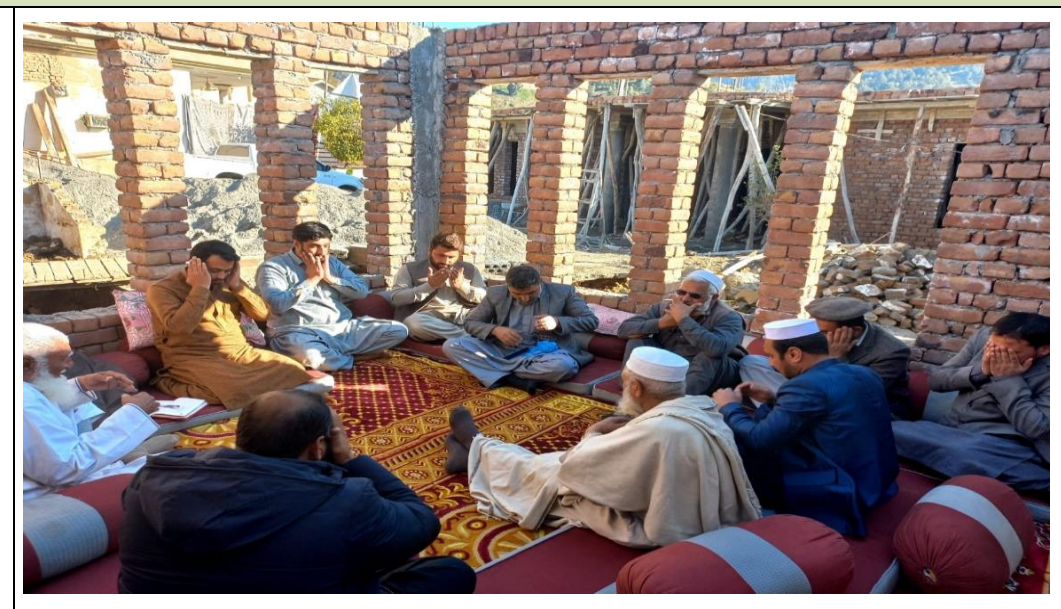
Photo2: shows the site selection for the Nursery establishment

Description of the photos Photo1: shows the CBO formation